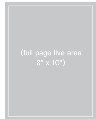
FULL PAGE 8.5" X 11"

DEADLINE FOR AD SUBMITTAL IS MONDAY, MAY 8, 2017